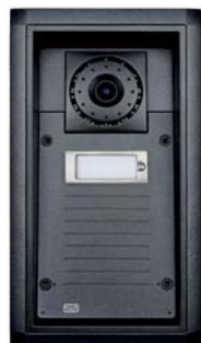
2N® Helios IP Force