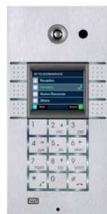
2N® Helios IP Vario