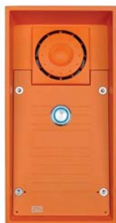
2N® Helios IP Safety