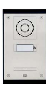
2N® Helios IP Uni

The 2N® Helios IP family is a wide range of door intercoms for every situation - whether in security, business, emergency, or any other special area.